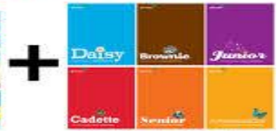
Girl's Guide to Girl Scouting