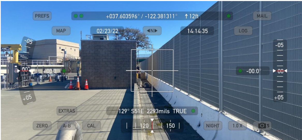
Photograph 3: View of the proposed billboard site; facing south.