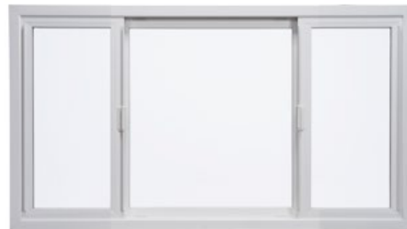
Figure 2. Example of a proposed window