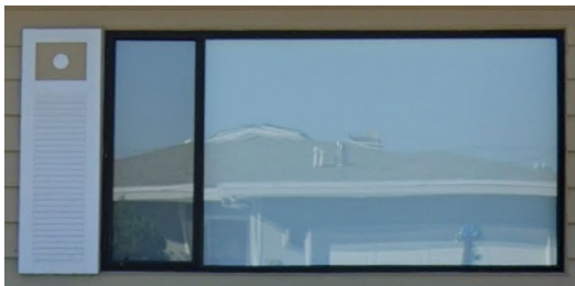
Figure 1. Example of window to be replaced