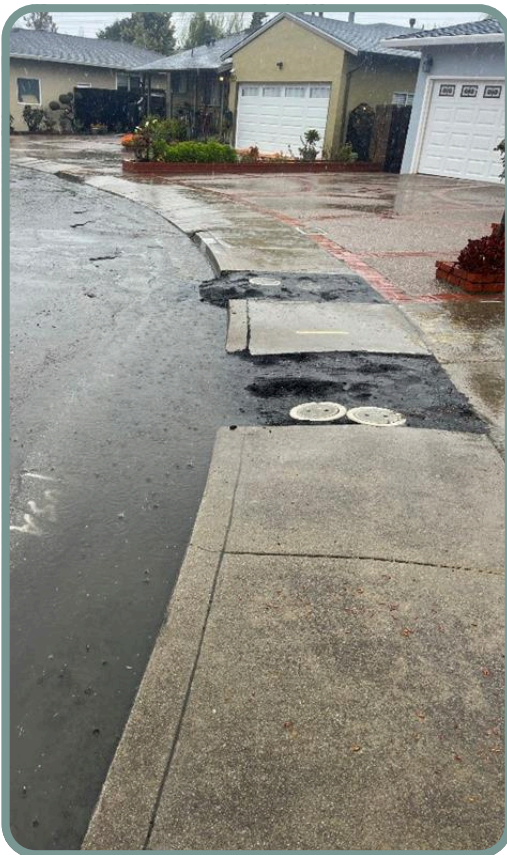
Current Condition during rain