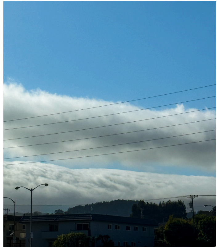
Photo of cloud formations taken at Millbrae City Hall on 09/25/25

As forecasters anticipate for the low-pressure system to weaken by midday Thursday, September 25, another unsettled weather pattern is currently developing and will bring rain early next week (ABC 7).