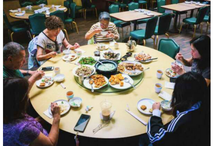
A rice porridge party at Porridge & Things in Millbrae.

This Chronicle recognition brings positive attention to our downtown corridor and establishes Millbrae as a dining destination. When local restaurants earn regional acclaim, the entire community benefits.