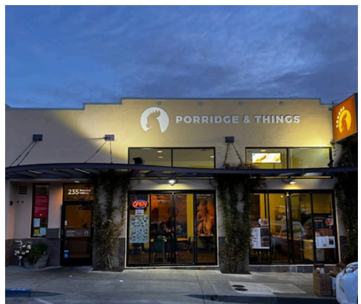
Porridge & Things 235 Broadway, Millbrae

Porridge & Things is open daily 11:00am to 2:30pm and 5:00pm to 10:00pm. Next time you're looking for a unique dining experience, discover what San Francisco food critics found so special right here in Millbrae.