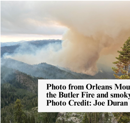
Photo from Orleans Mountain of the Butler Fire and smoky skies Photo Credit: Joe Duran (7/9/25)