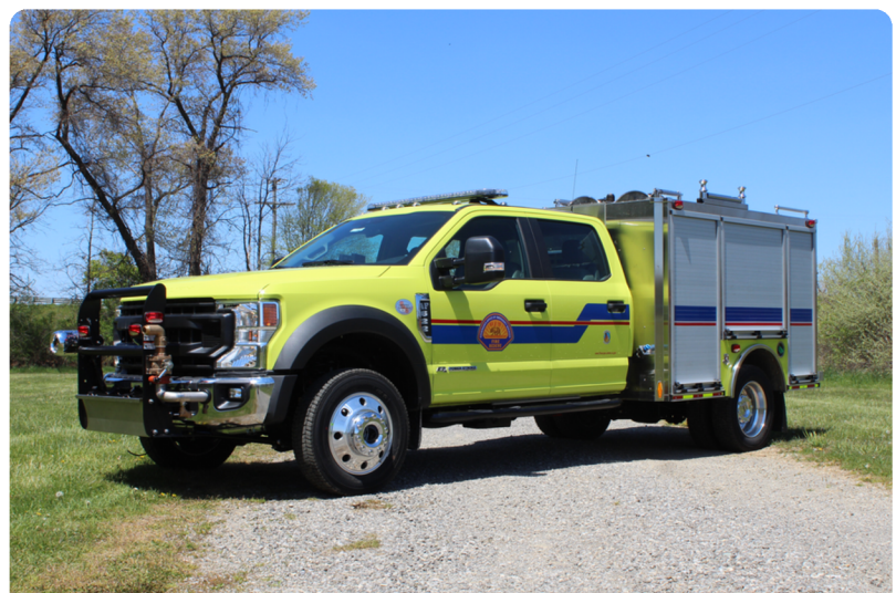
Type 6 Wildland Fire Engine dispatched 7/11/25

Thank you CCFD Firefighters for your bravery and service.