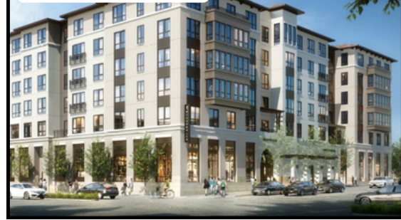
Rendering of One Meadow Glen (Former Office Depot)