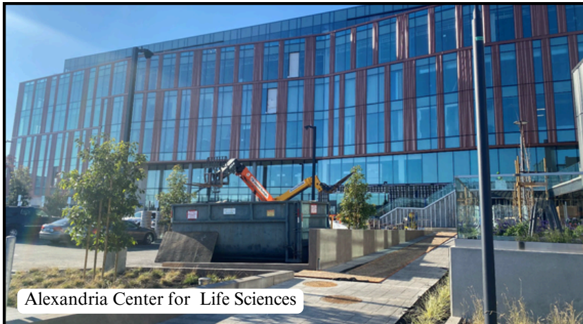
Alexandria Center for Life Sciences