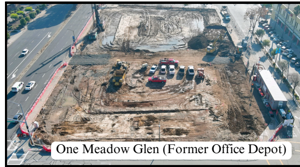
One Meadow Glen (Former Office Depot)