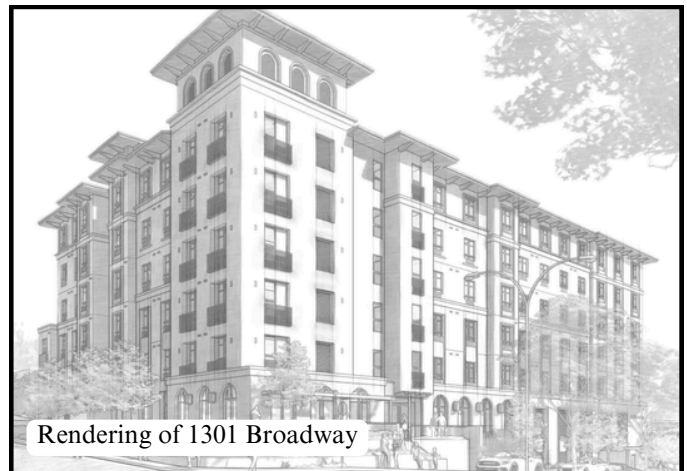
Rendering of 1301 Broadway