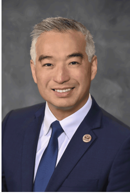
Anders Fung Mayor